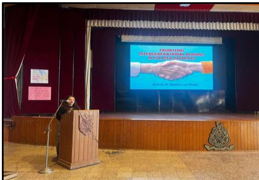
Workshop on Promoting "Intergenerational Bonding With College Students"(December 17, 2024)