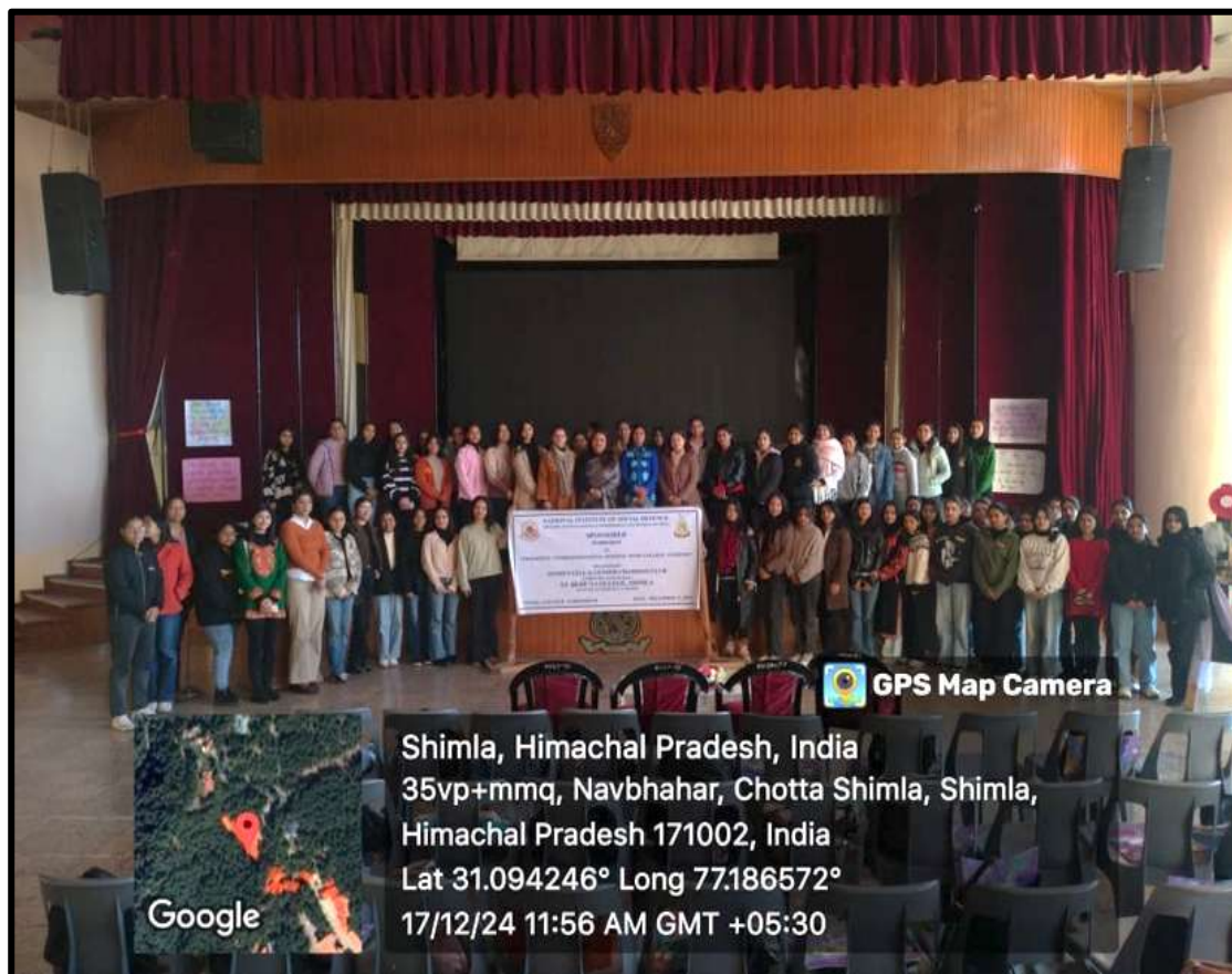
Workshop on Promoting "Intergenerational Bonding With College Students" (December 17, 2024)